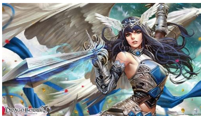
[Rally to War] Exclusive Playmat