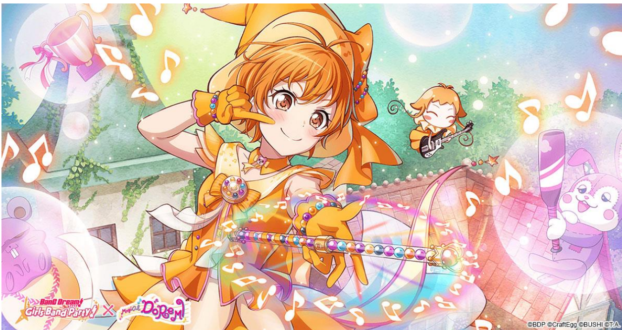
★3 Misaki Okusawa [Resigned Witch] (After Training)