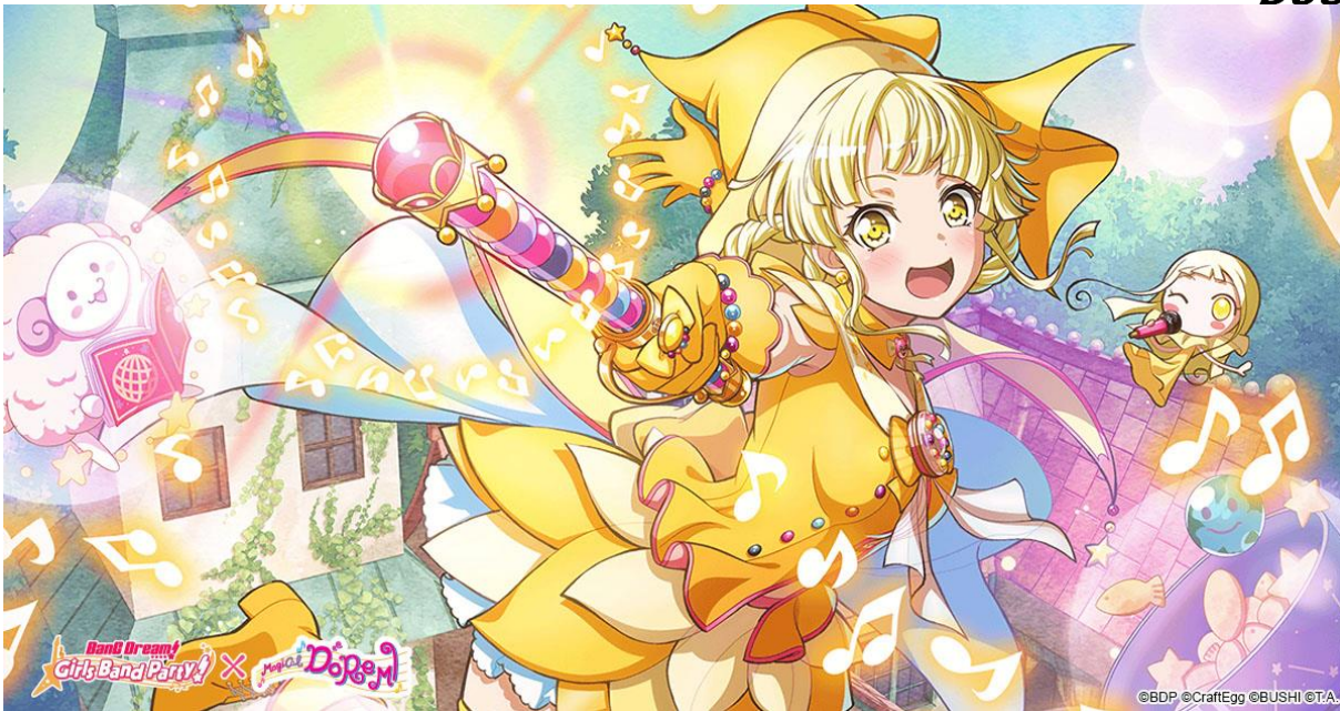
★4 Hagumi Kitazawa [Powerful Witch] (After Training)