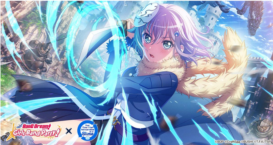
★4 Tsukushi Futaba [The Praised One] (after training)